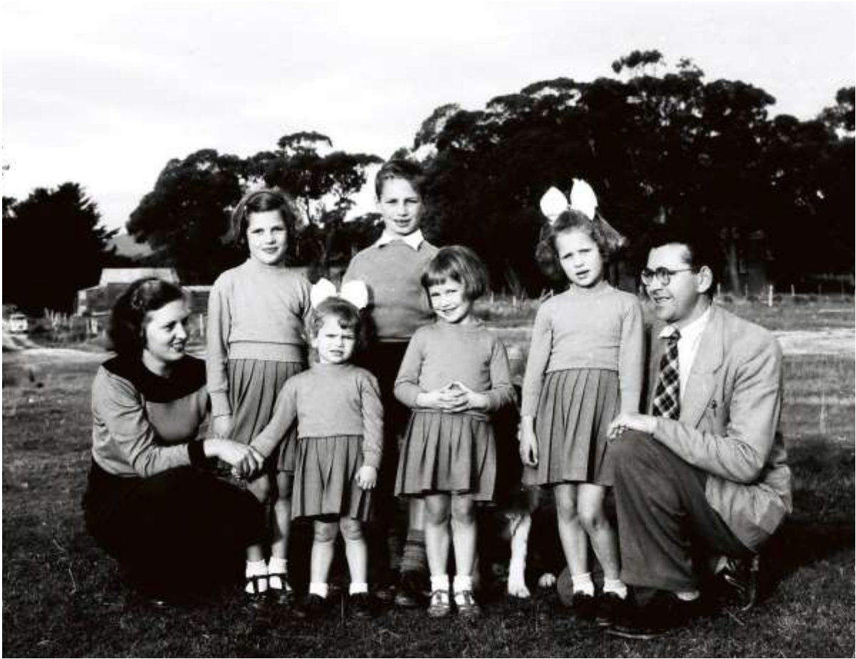
The Schellens family: