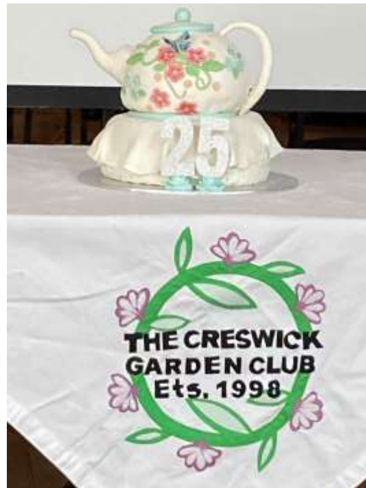
Creswick Garden Club 25 th Anniversary