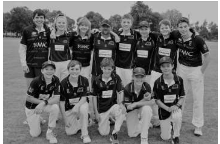
Creswick Imperials U15