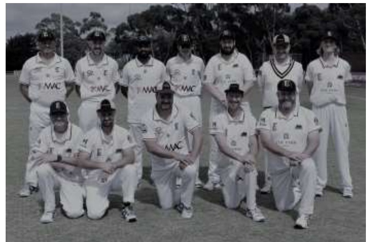
Creswick Imperials Second XI Division 2 team