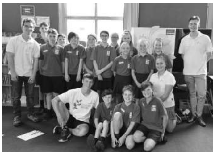
St Augustine's students at Dream Seeds workshop

Another highlight was three students from Newlyn Primary