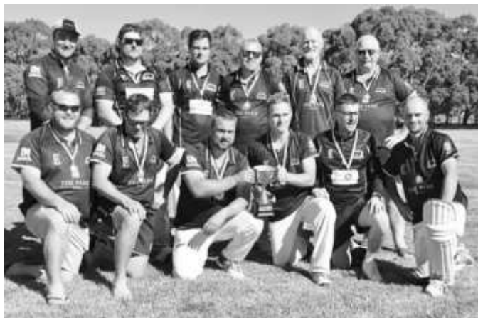
Creswick Imperials A Reserve

The Creswick Imperials Cricket Club (CICC) has had a very successful 2019/20 season. The Club's top team in the Maryborough and District Cricket Association (MDCA) A Reserve competition finished Premiers in both the one day and two day competition. In trying circumstances the Grand Final was called off a few days beforehand. CICC was declared the winner after finishing on top of the ladder.