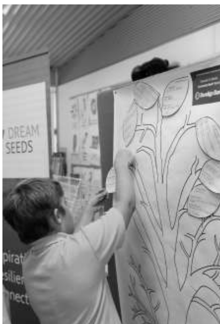
Creswick North PS students at the Dream Seeds workshop