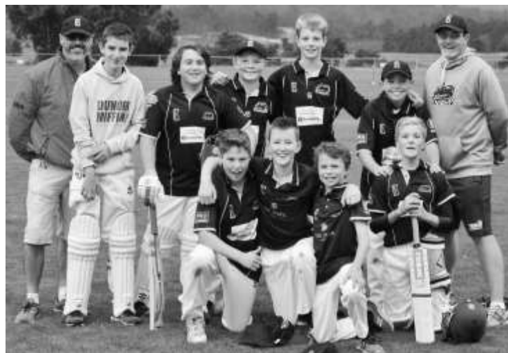
Creswick Imperials Under 13 Gold