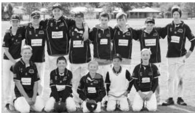
Creswick Imperials Under 15 Semi Final