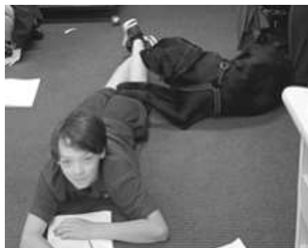
Ollie, the school support dog

However, the school did welcome back a very special old friend during term 1, who has joined us permanently, Ollie, the school support dog! Ollie arrived at Creswick Primary School as a pup and trained through Vision Australia to be a Seeing Eye Dog during 2019. He spent twelve months here and then in Melbourne at Vision Australia, learning specific tasks. He was much loved around school and everyone was very sad to see him leave, although it was completely understood that it was all part of his program.