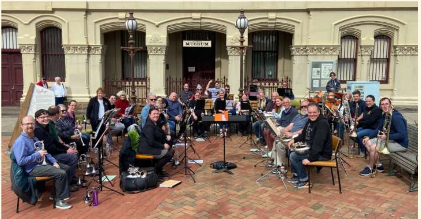
Creswick Brass Band and Glenferrie Brass joint street performance, Sunday , 28 March 2021

Both bands are preparing to play for the upcoming ANZAC Day ceremony in Creswick where they will participate in the march and morning service. The annual Salute to the ANZACs Concert is being planned to adhere to COVID-19 safety guidelines so keep an eye out for further information.