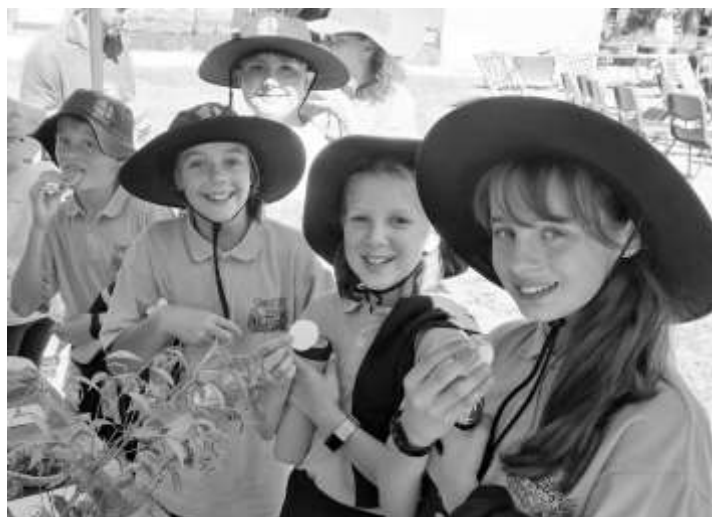
Students enjoying tasting the food