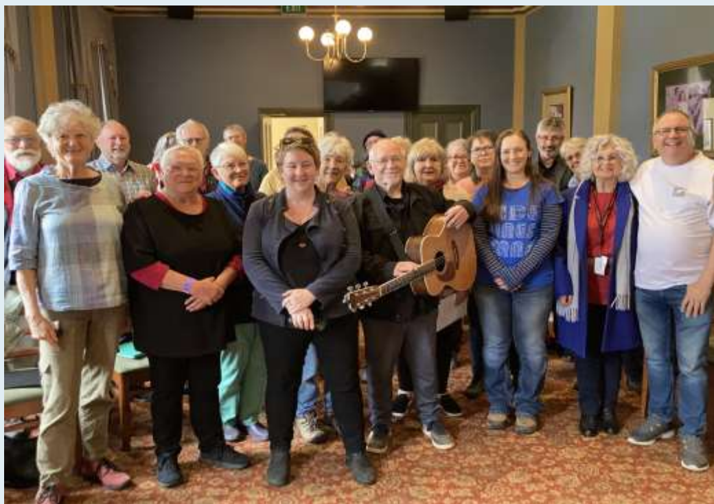
Eric Bogle and Festival Choir

The Creswick community came out in force at the CresFest street parade to celebrate, cheer, applaud and thank performers and volunteers who participated in the inaugural CresFest over the weekend of 1 - 3 April. The parade was awash with colour, music, dancing and singing. Laughter and happiness radiated from the delighted faces of children skipping along with the Morris and Bulgarian Dancers , marching in time with the Creswick Brass Band , boosted by the Invy Horn Jam and Kyneton Street Band , while their parents joined in the joyous singing of the different choirs who entertained visitors over the weekend.