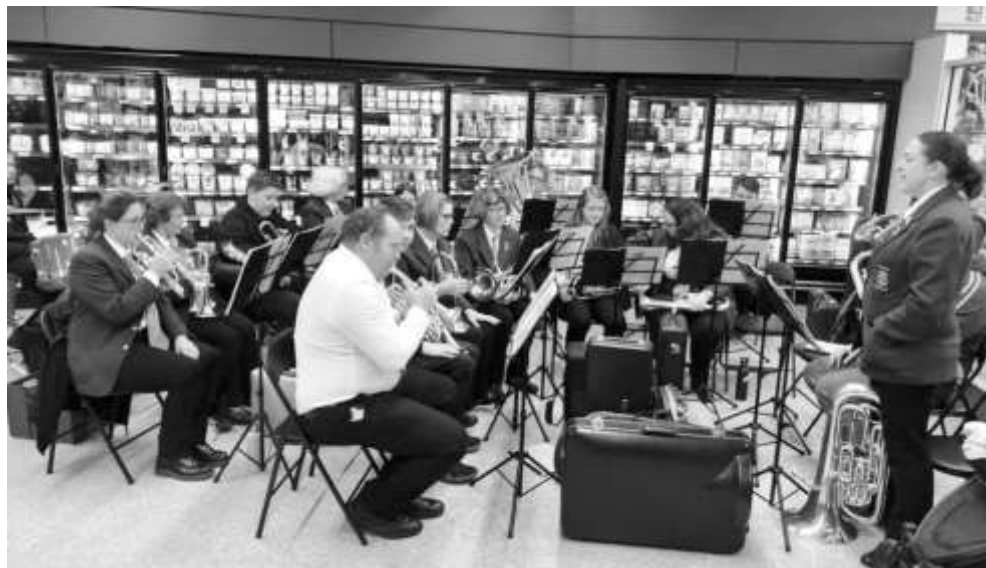
Creswick Brass Band entertaining customers in the new Creswick IGA Supermarket on Saturday morning 10 June