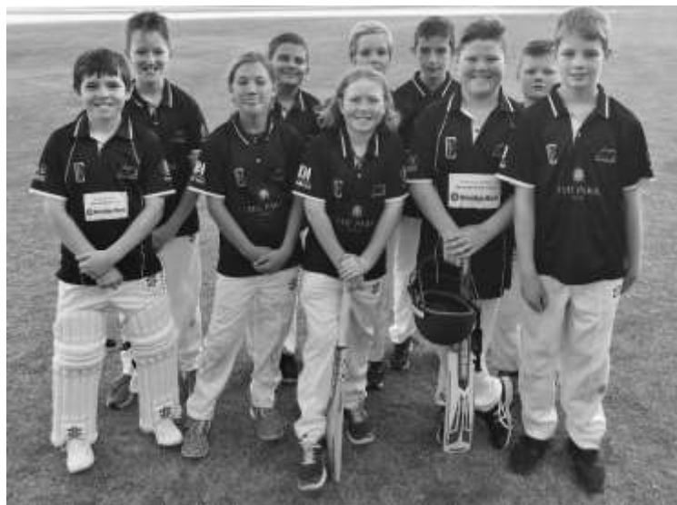
Creswick Imperials Under 13 Gold, 2018/19

Recruiting has begun for Under 12, Under 13 and Under 15 for the 2019/2020 Ballarat Cricket Association competition. Creswick Imperials are excited to announce there will be three age groups this year after a fantastic year last season. The Club is particularly interested in hearing from anyone wishing to play in the Under 15 age group. This competitive cricket for boys and girls takes place in a fun and supportive environment.