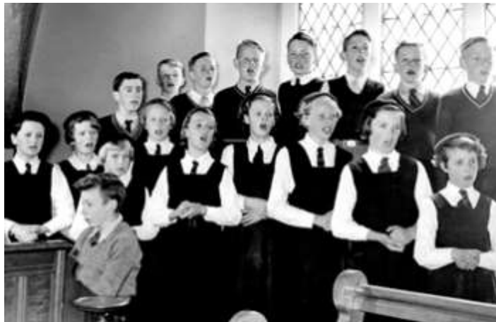
The school choir singing in the new church choir loft in 1957. Includes some of the Dutch children.

In researching the story and history of St Augustine's over the past 150 years it has become clear that this is not just a church building or a place of worship. The significant contribution made by many families and individuals to both the Parish and community of Creswick and district is very evident.