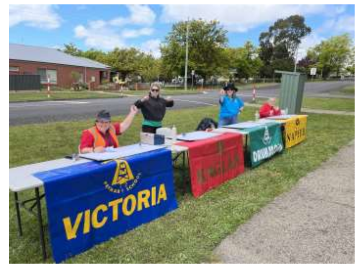
All set up for recording the laps

Recently, the annual school Jogathon was held. This is the school's largest fundraiser each year and has been conducted for thirty-seven years. The weather was extremely kind as students, staff, families and friends made their way around the 700-metre course over a two-hour period. This provided a great picture of our school community - a sea of red, green, blue and yellow (the House colours) meandering around the block.