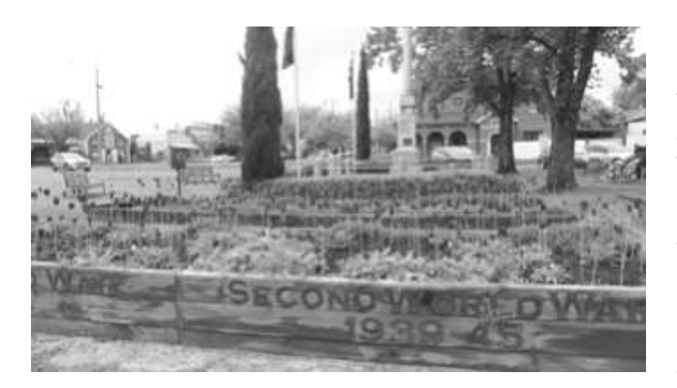
Creswick Memorial Garden