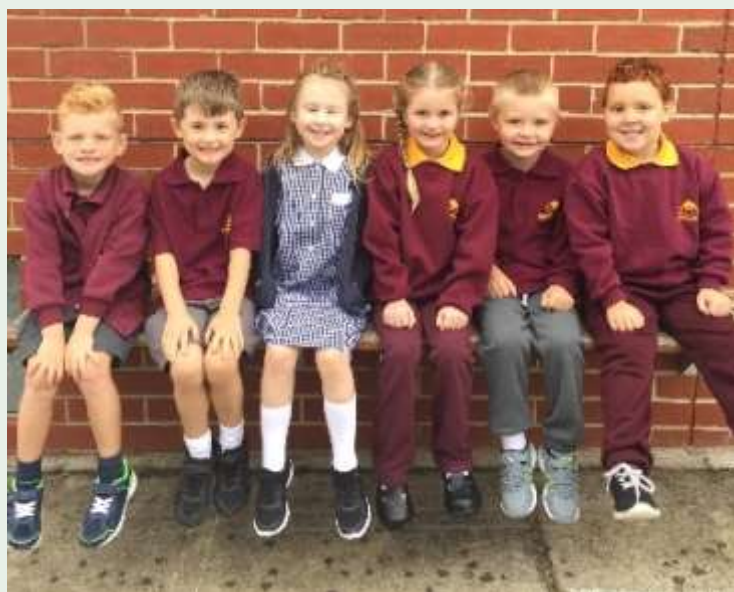
Creswick North Primary School Foundation students. See article on page 17.