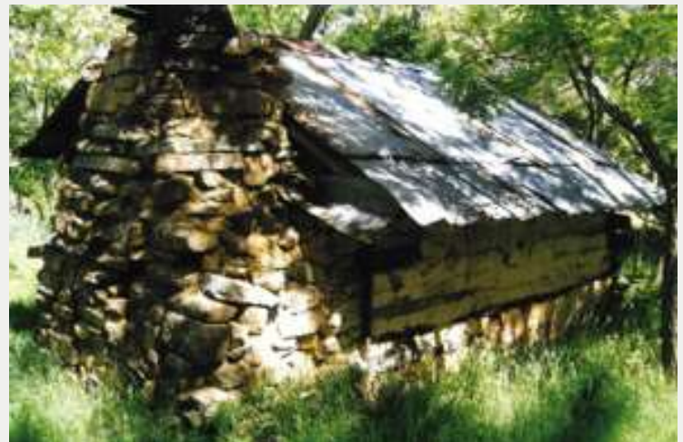
The La Franchi shack in Werona