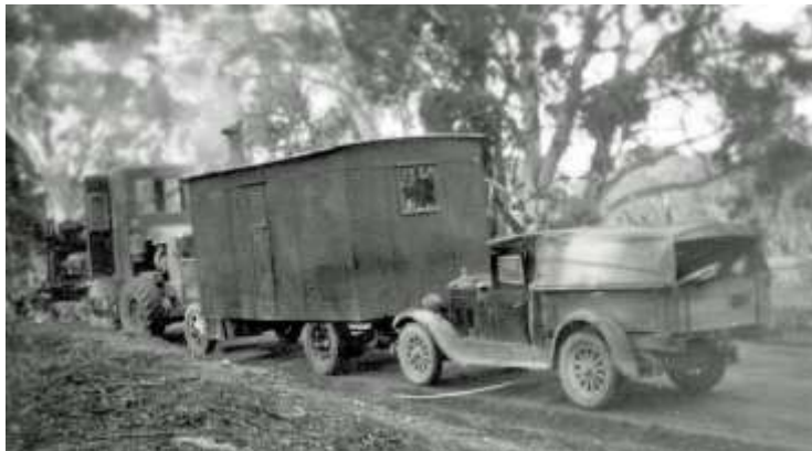
The car following the caravan

At fifteen Nell left school, and with six more at home to be educated she started work at the Hosiery factory which was located near where the Creswick RSL Hall is now. Nell admits she was 'no good at it' and lasted only three weeks. She subsequently worked at Wally Sudweek's shop in Creswick (now The Farmer's Wife ) selling haberdashery.