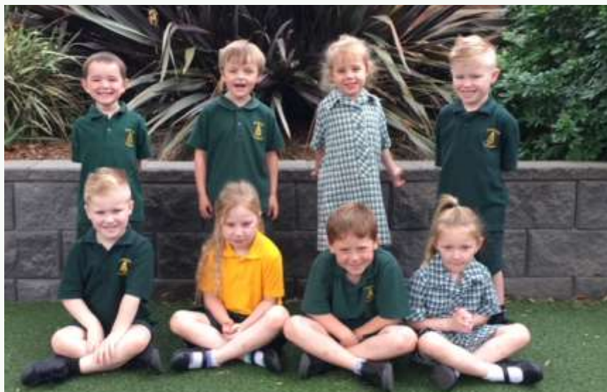
Twenty-four Foundation students began their primary school journey