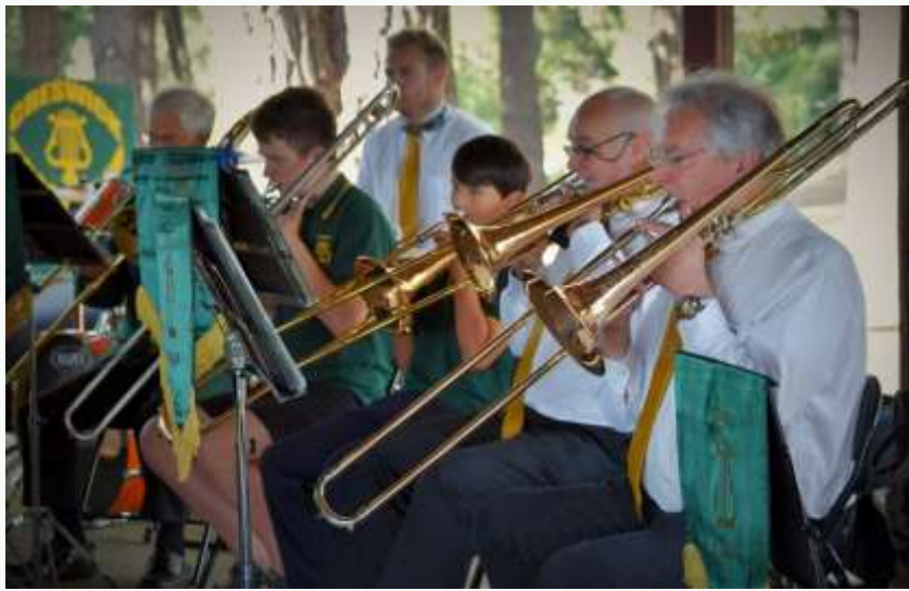
Visitors to the Australia Day Breakfast at Park Lake Creswick were entertained by the Creswick Brass Band