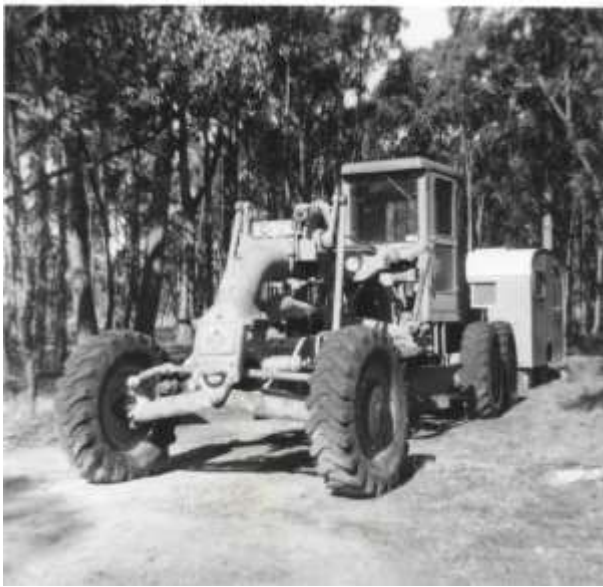
The grader pulling the big green caravan