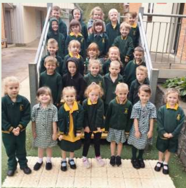
Creswick Primary School Foundation students (see report on page 14)

Note: Napier Street, Creswick is permanently a 40km zone.