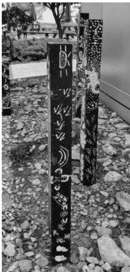
Koori garden totem poles