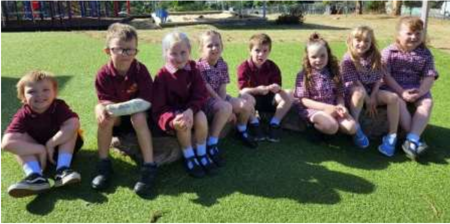
2023 Foundation Students

All families have enjoyed a wonderful holiday break and students have returned ready for another great school year at Creswick North PS. With lots of new students the school is a busy place. The school uniform has had a re-design and all students look great in the new gear.