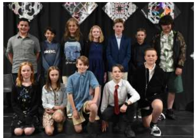
2022 Graduating Students