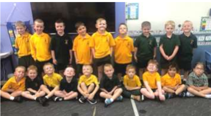
2023 Foundation Students