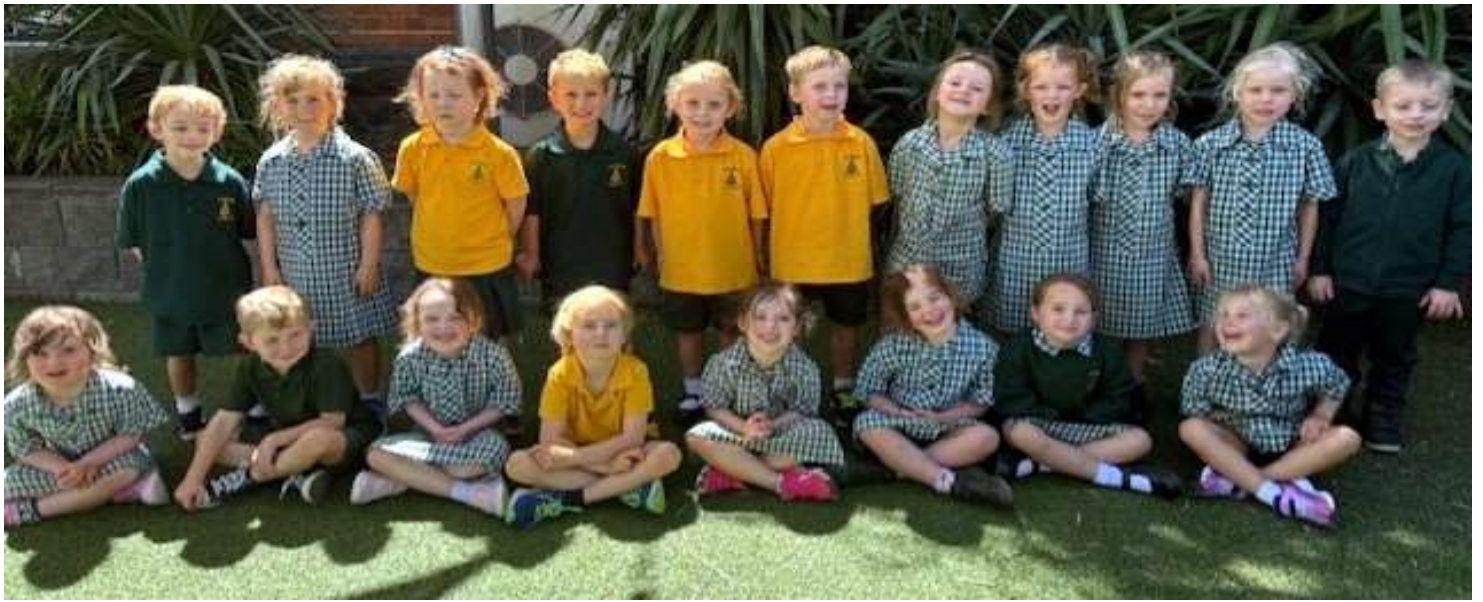
Creswick Primary School