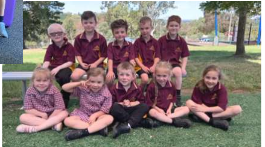
Creswick North Primary School