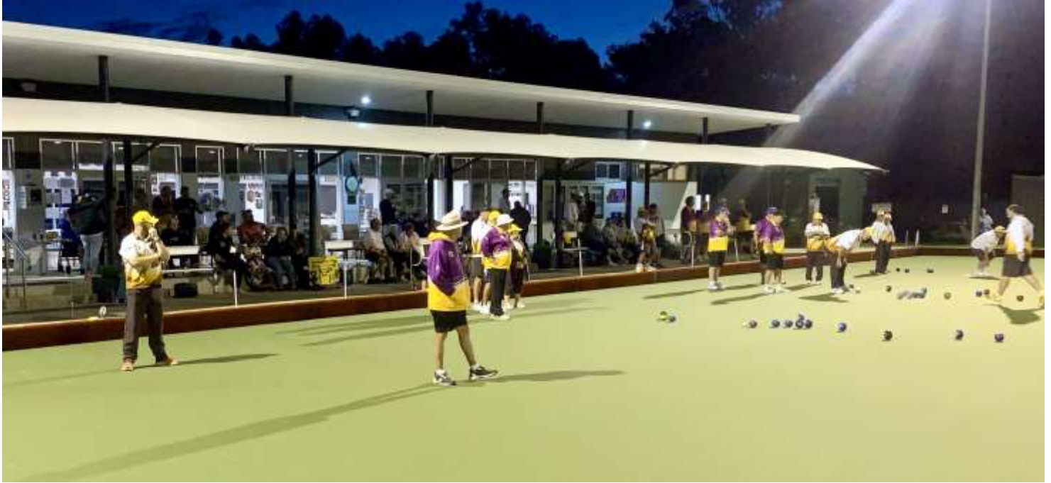
Bowling under lights – Pennant game between Creswick and City Oval

Pennant bowling has now resumed. In Midweek Pennant on 16 January, Division 1 went down to Learmonth by two shots and Division 4 had a solid win over Ballarat.