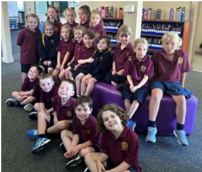
St Augustine's Primary School