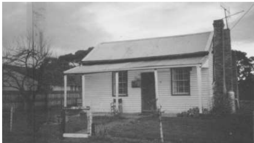
Rossmore Cottage c1950s

Many will have noticed the cute little cottage called Rossmore , situated at 12 Bald Hills Road Creswick, which has operated as a Bed & Breakfast business since 1996. Margaret and Neville Giles purchased the property in 1994 and renovated the back section, building a new kitchen, laundry, toilet and bathroom. The front section of the cottage was left untouched except for the addition of antique mantelpieces, a combustion heater and a gas log fire heater. Unnamed when they bought it, Rossmore was Neville's second name.