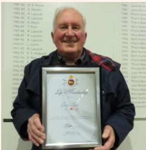
See page 6