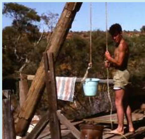
On the Canning Stock Route