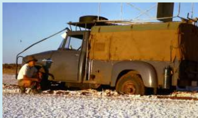
Stuck on Salt Lake