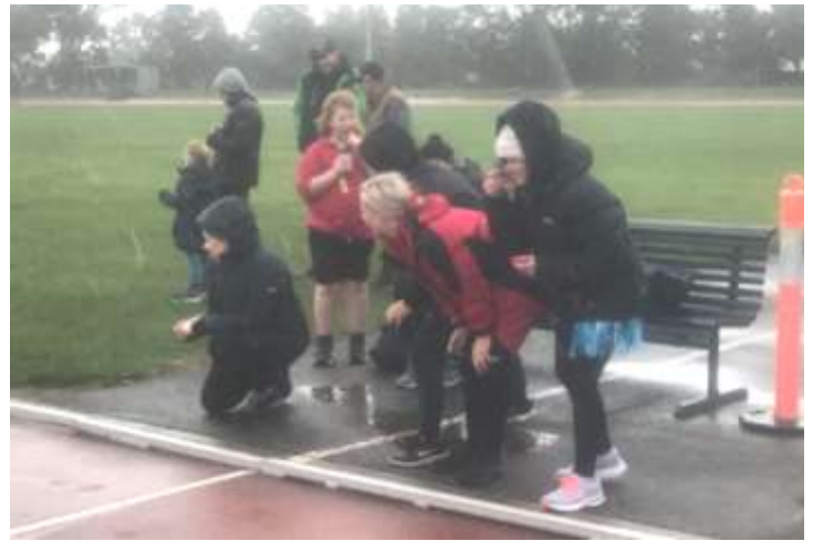
Hardy participants at Llanberris

The student leadership team attended a conference at Federation University called Generosity Responsibility Integrity People ( GRIP ), where they learned the qualities of a good leader, interacted with students from other schools in similar positions and were given the opportunities to role play strategies discussed on how an effective team operates. This event followed the schools involvement in