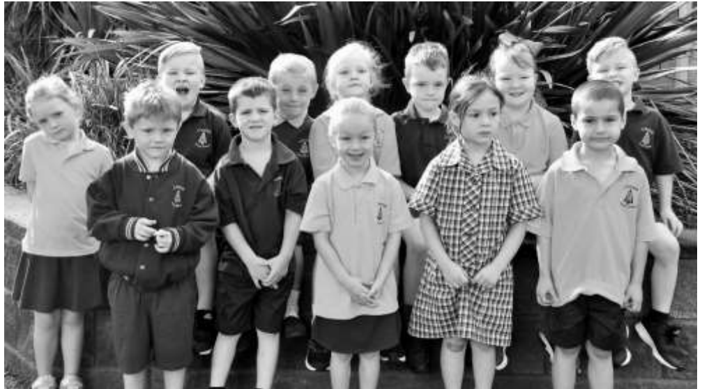
Above: 2019 Prep students Left: Footsteps Dance Program

It has been a busy start to the 2019 school year at Creswick Primary School. Twenty-seven excited Prep students began their journey and made a fantastic start to school, spending time with their buddies and getting to know other students in their grade. We are very proud of the amazing start they have made to school.