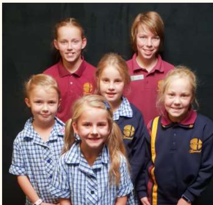
St. Augustine's Student Representative Council Members