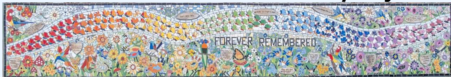
Mosaic enlarged on pages 8 and 9

The Mosaic Group of Creswick's U3A (University of the Third Age), has recently installed a five metre long mosaic called In God's Garden , at the Creswick Cemetery. It is situated on the ground in the Children's Section in front of the seat donated by the Creswick Craft Group. This is opposite the office at the Cemetery, and is designed to be viewed whilst sitting on that seat.