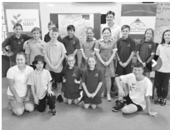
Students from Creswick North and Newlyn PS at Dream Seeds workshop