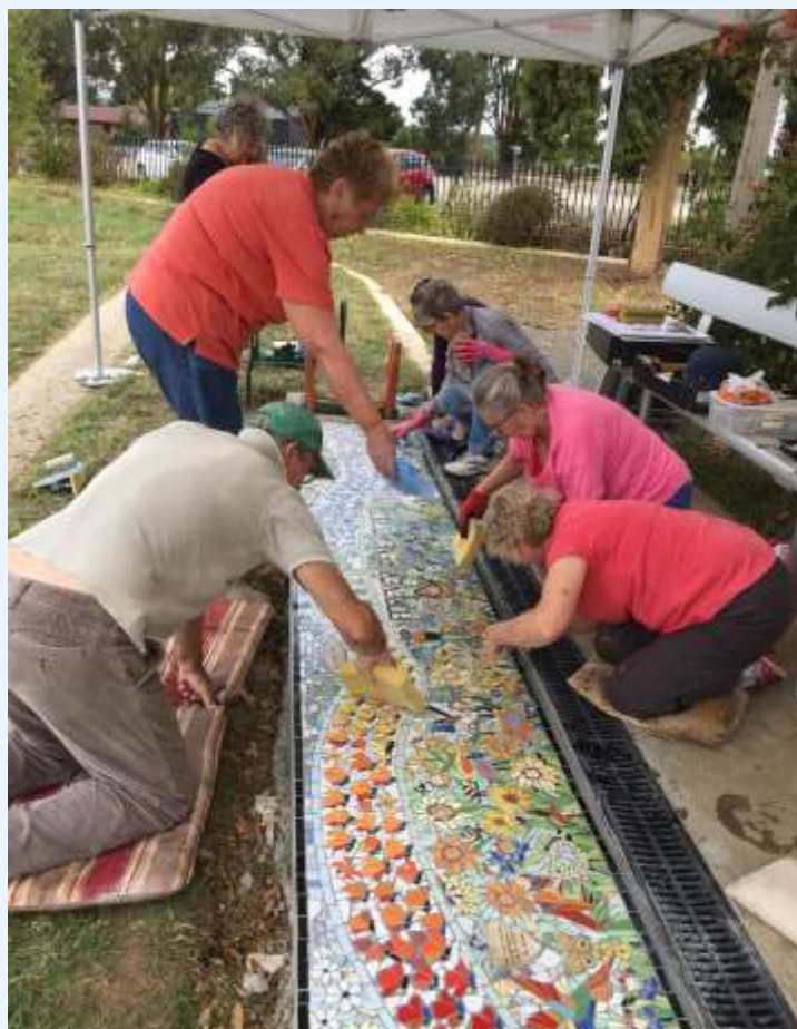
Members of the Mosaic Group putting finishing touches on their Mosaic 'In God's Garden' at the Creswick Cemetery.