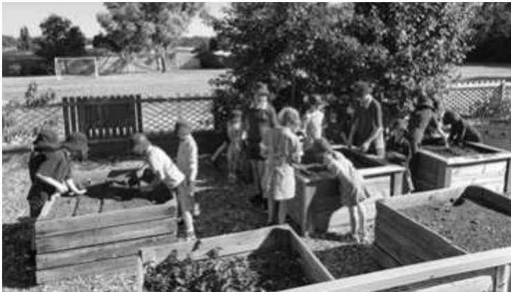
Students doing some planting with their buddies in the vegetable garden.

The students have also been able to start some work in the vegie garden, planting some herbs, fruits and vegetables. Hopefully, in time, it will be possible to utilise this produce in cooking sessions.