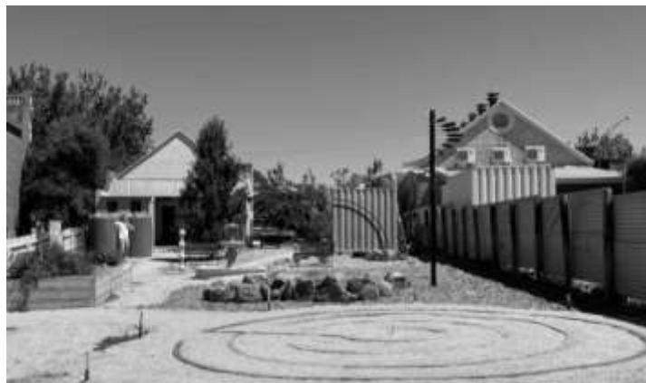
The Sensory Garden at Shannon's Bridge

Some organisations might have had less activity during COVID restrictions, but not Shannon's Bridge. Even though the End of Life Care Hub (94 Albert St Creswick) had to close its doors during the lockdowns, Shannon's Bridge volunteers were active throughout, supporting the community with end of life care needs.