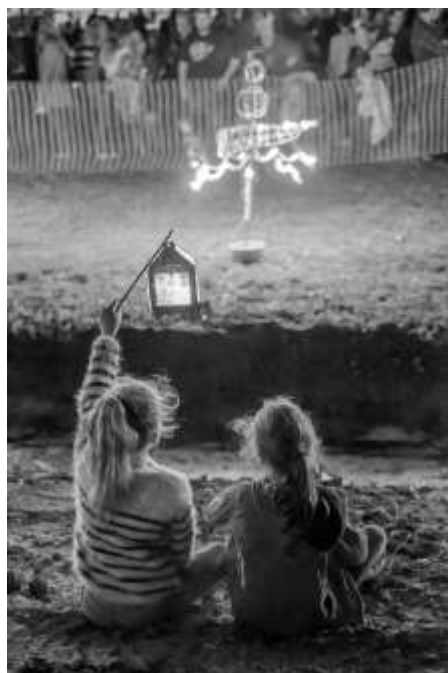
The Lantern Festival

The Yartz (as Barry Humphries so brilliantly dubbed the myriad forms creativity takes) are calling, if not from glen to glen, then certainly from our recent meeting where members and supporters of Pavilion Arts came together to discuss The Future .