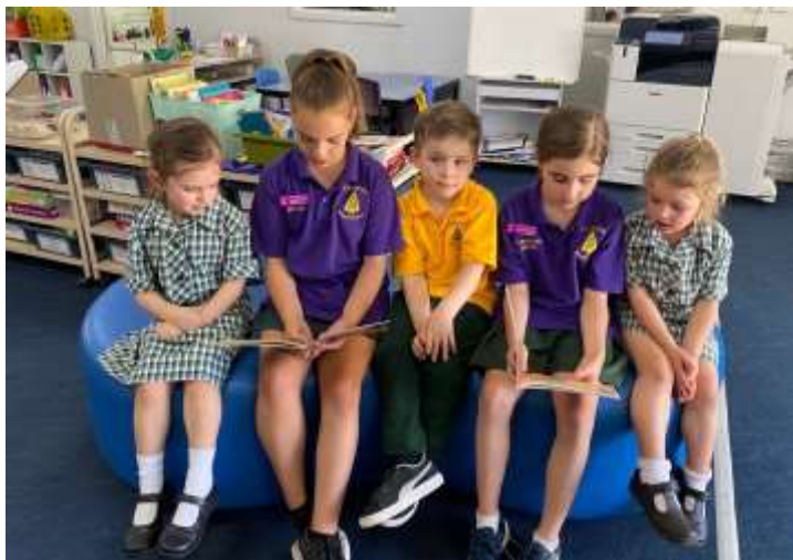
Playground Mentor and Foundation students

The Foundation students commence full time attendance this month, which is very important for their learning routines as they now experience both classroom and Specialist (Art, PE and LOTE) subjects. They have also been linking in with some of our older students as their Buddies