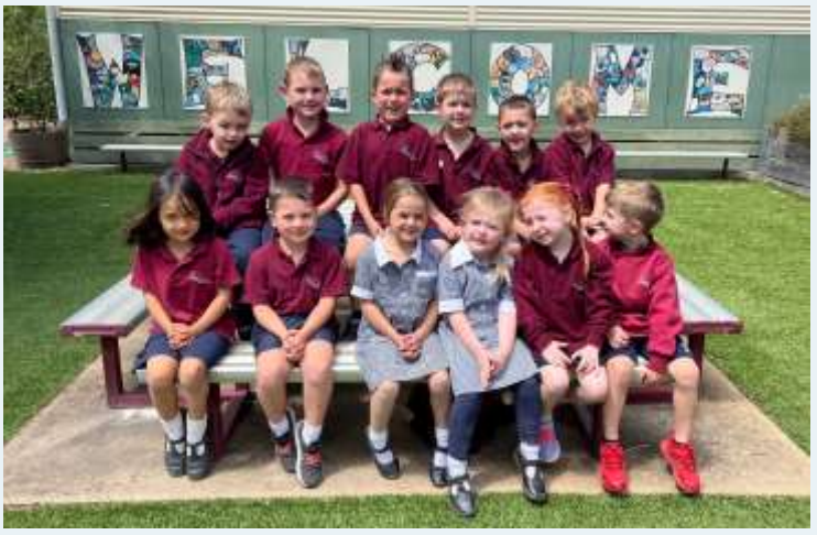
Mt Blowhard PS 2023 Foundation students