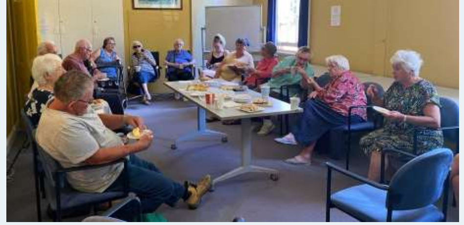
JCAC Independent Living Unit residents and family enjoying a social catch-up