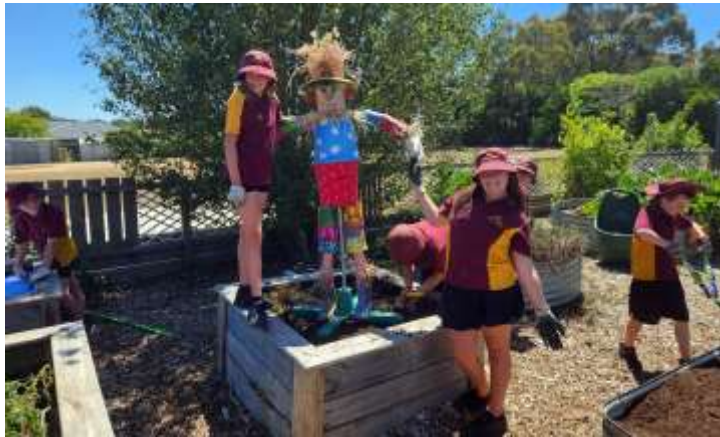
Senior students cleaning up the school's veggie garden and installing the award-winning scarecrow

The students have started all core curriculum subject areas, as well as specialist areas like PE, Japanese, Art, Music, Drama and visits from the MARC Van.