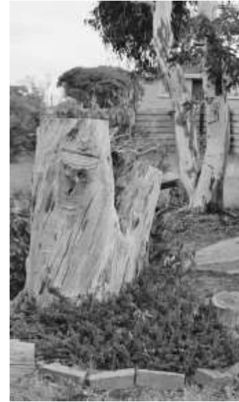
Old stump with prostrate grevillea, hardenbergia, dwarf magnolia, native grass and amaryllis bulbs planted around it.

My reading on garden design repeated the same five elements - colour, line, form, texture and scale, combining to create a harmonious whole. Accidentally I had combined all, which was a win for a gardener whose 'design' approach is Edna Walling extrapolating on Japanese garden design under a wannabe permaculture umbrella.