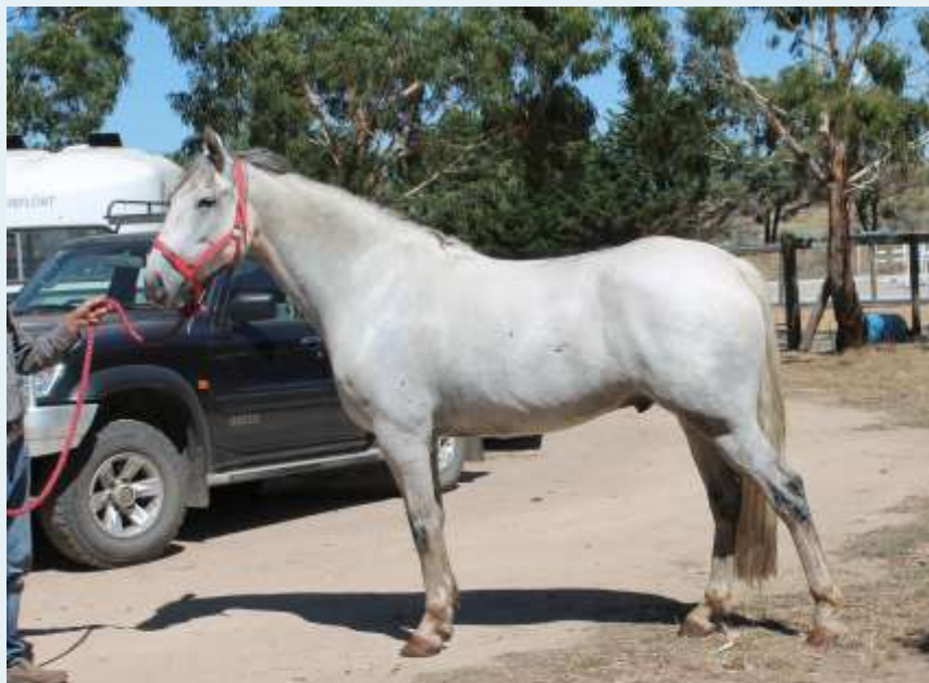
Dardanelle, stallion ex Cordillo Downs Station, SA