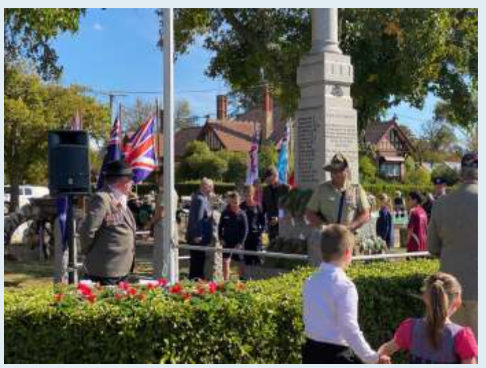
School Leaders at ANZAC Service