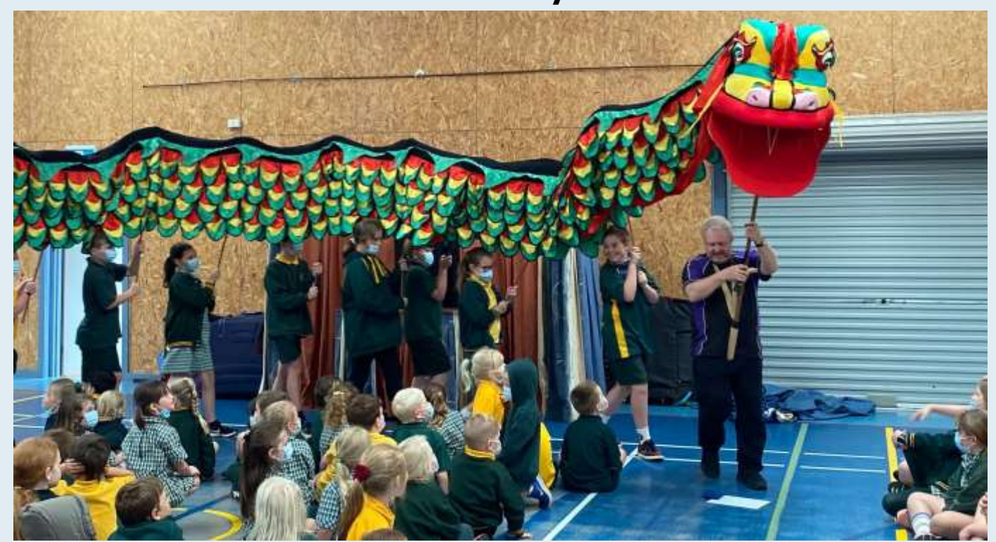
G'day Asia incursion Creswick PS.