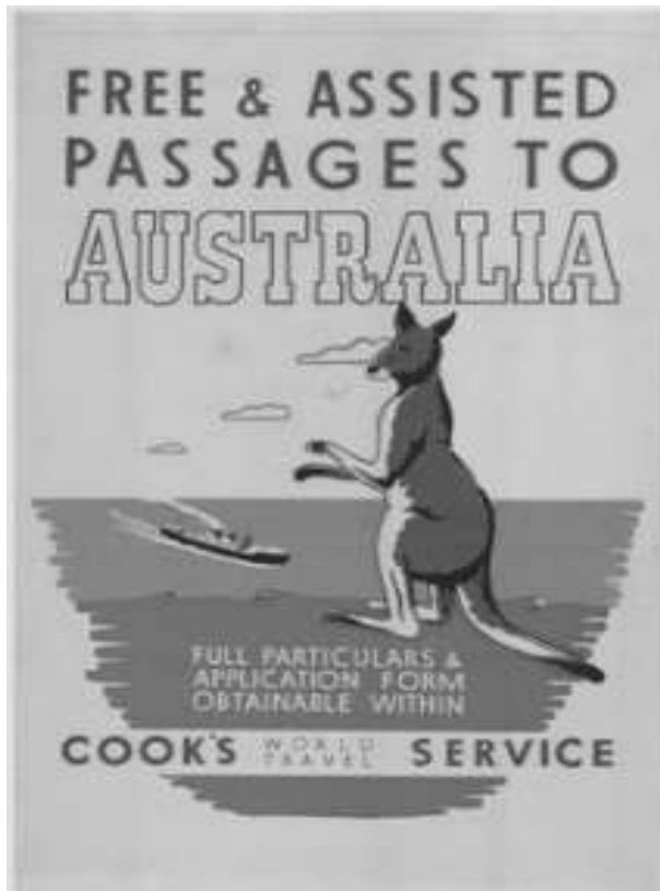
Poster promoting Immigration

The Dutch have been a great boon to Victoria. Since their first appearance in the 1850s as part of the gold rush period, to the present time, which sees almost 20,000 Netherlands-born people living and working here. Mostly the Dutch have settled into the Australian way of life and do not think of 'going home'. They are hard-working, family oriented and thrifty. Their homes and work are here and they are happy with that.