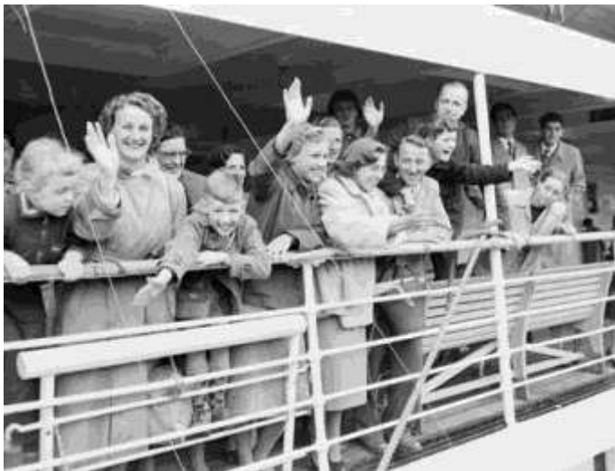
Dutch immigrants on board ship

A former army camp, the buildings had been re-purposed for migrants and opened in 1947. Between 1947 and 1970 around 300,000 migrants and displaced persons came to Australia from war-torn Europe, and about half of these came through Bonegilla where they were taught English and learned about life in Australia. Some were lucky and were offered work in surrounding areas where there were labour shortages. Some of the men went by train to Melbourne to look for work and, if they found a job, would bring their family to join them. Some moved from job to job and house to house, trying all the while to improve their financial position. Not everyone was happy at Bonegilla as it was very isolated from the main centres of employment. Albury, Wodonga and Wangaratta were the nearest towns where women could shop for new clothes and their children's requirements.