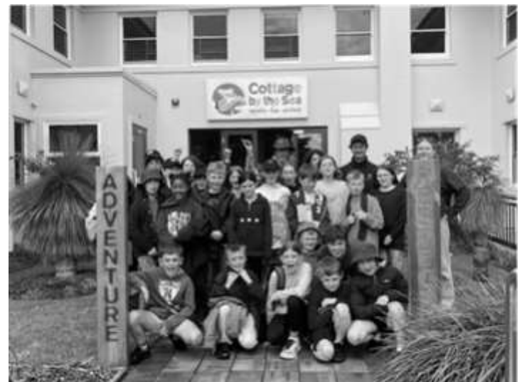
Students out the front of the Cottage By The Sea camp.