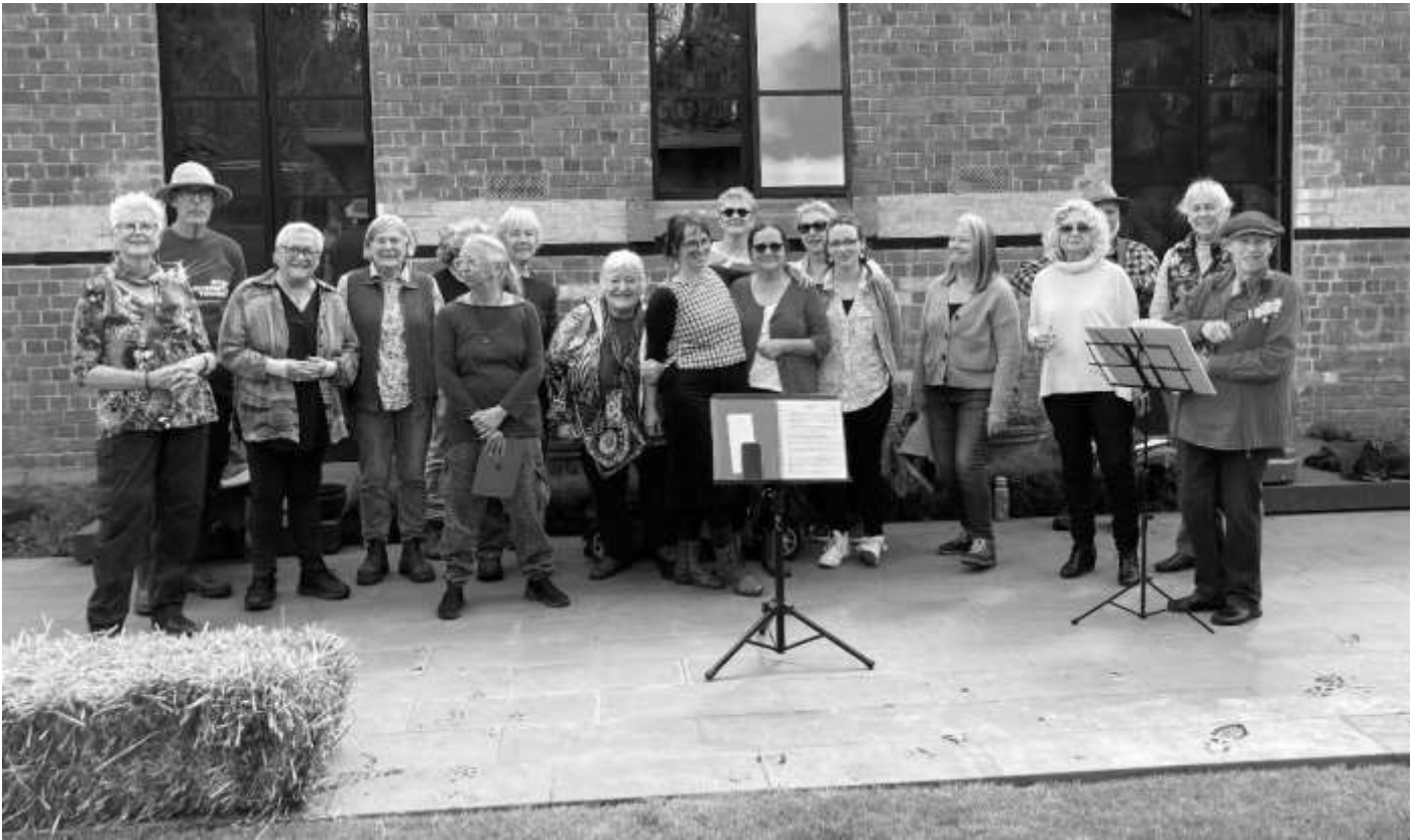
The Creswick Chorus performing at the Open Gardens of Kingston's Primary School

To mis-quote Jane Austin, (and sincere apologies for doing so) it is a truth universally acknowledged, that everyone has a singing voice. And, the more you sing, the better your voice becomes.