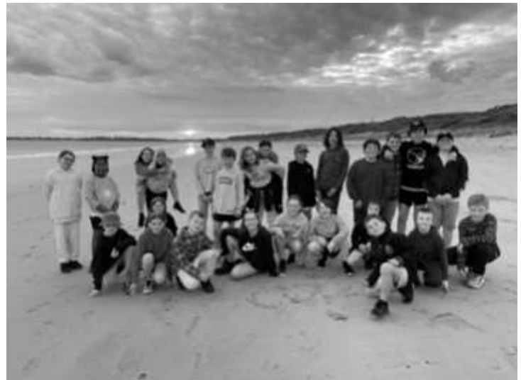
Students on the beach at Queenscliff.