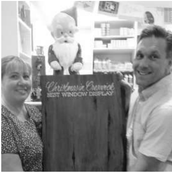
Winner inaugural Christmas decorations, December 2017, the Creswick Pharmacy

Well it's that time of the year again when Xmas is on the not too distant horizon. We decorated the town last year and it looked fabulous, thanks to all the groups in town. All the town schools plus Newlyn School took part. Also the people of Creswick with their generous raffle donations.