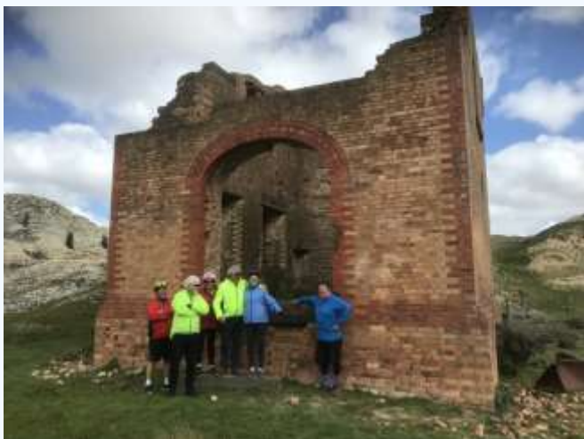
Creswick Senior Cyclists visiting gold mining era local landmark

The Creswick Senior Cyclists are a part of the local VOGA Cycle Club and have been meeting twice weekly since April for casual cycling and friendly companionship. Creswick weather has been kind with only one or two days being too miserable to consider venturing out onto the highways and byways of the district. The aims of the Senior Cyclists are to promote friendship between participants and to greatly increase their fitness levels.