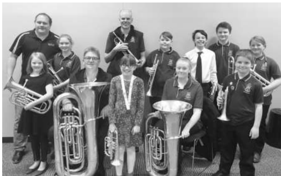
Creswick Band South Street Crew