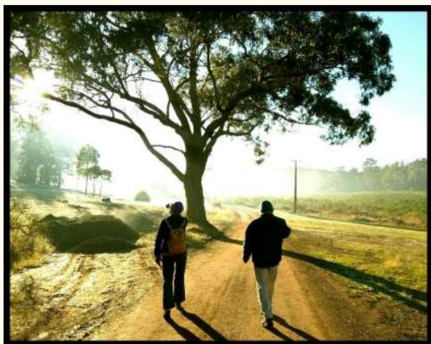
Members of the Walkers Group enjoying a Mid Winter Walk in North Creswick.