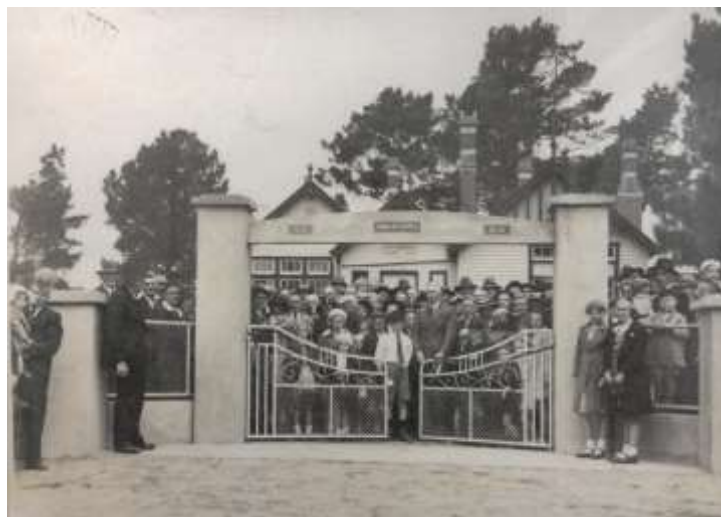
The Jubilee entrance and gates in 1938 and 2023