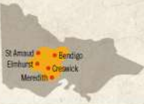
Map of the Central Victorian Goldfields region.